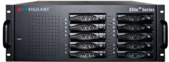
Vigilant Elite™ Series

Vigilant Elite is fully compatible with Vigilant ViewStation and Vigilant NetView.